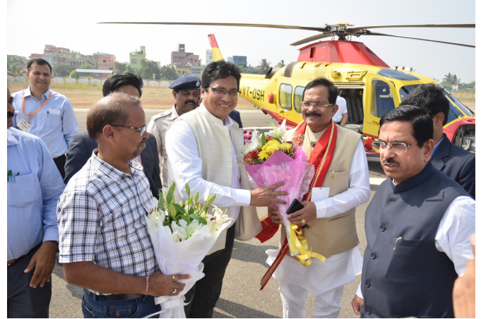
Shri Pradip Kumar Das, CMD, IREDA, warmly received Shri Pralhad Joshi, Hon'ble Union Minister for New & Renewable Energy, Consumer Affairs, Food & Public Distribution (left), and Shri Shripad Yesso Naik, Hon'ble Minister of State for Power and New & Renewable Energy, at the Puri Helipad in Odisha.