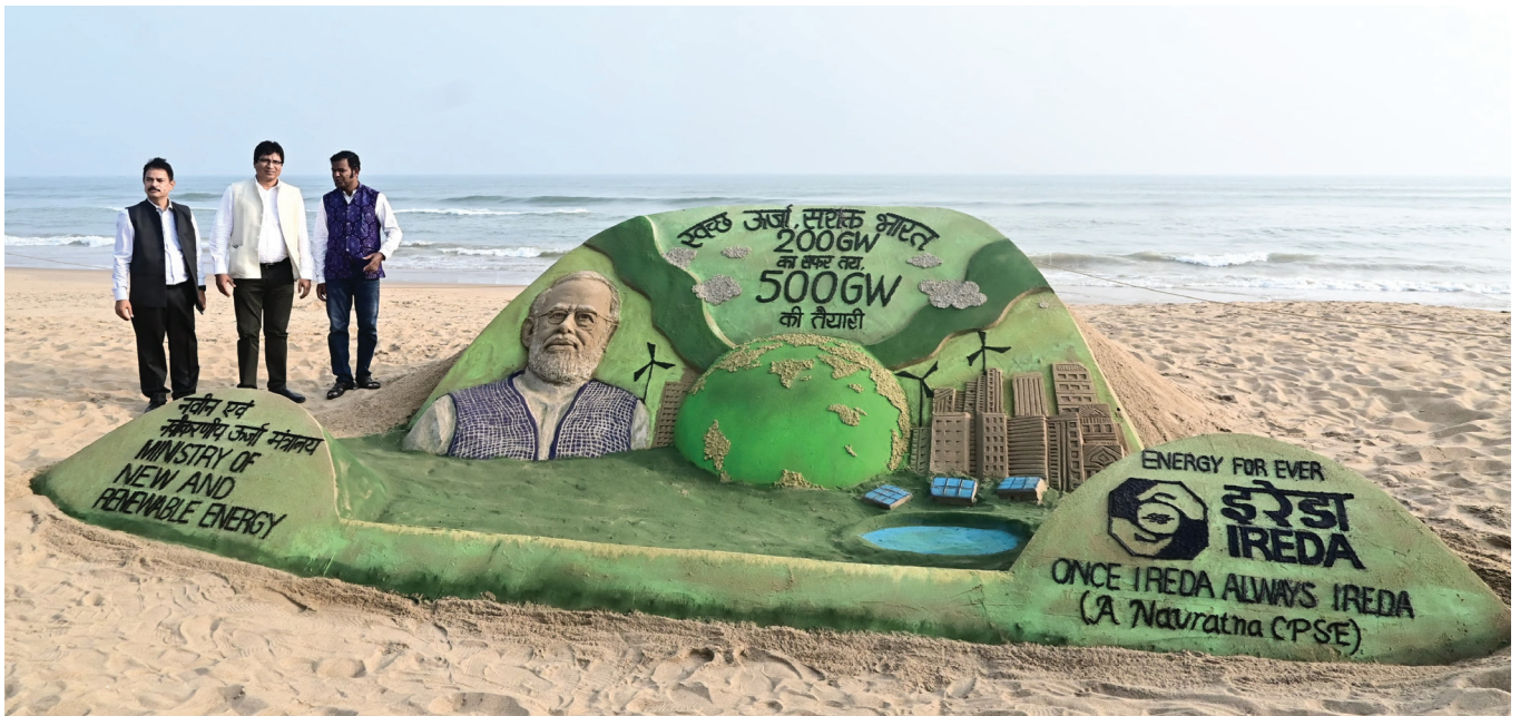
CMD, IREDA, along with Director (Finance) and Team IREDA, visited Puri Beach to witness a remarkable sand sculpture by internationally renowned sand artist Sudarsan Pattnaik. The sculpture, celebrating India's achievement of crossing the 200 GW renewable energy milestone, featured an image of Hon'ble Prime Minister Shri Narendra Modi and the logos of IREDA and MNRE. The artwork served as a creative tribute to India's commitment to expanding its renewable energy capacity and advancing towards a sustainable energy future.