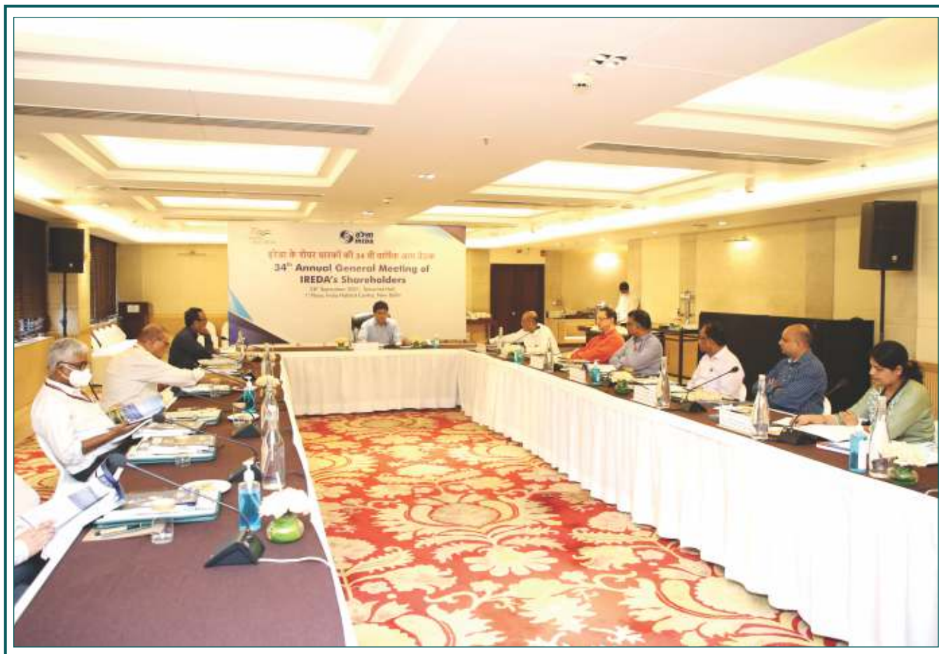
34 th Annual General Meeting of IREDA held on 28 th September 2021.