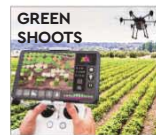
GREEN SHOOTS The pandemic had propelled the agritech sector, but investments fell by 45% (estimated)