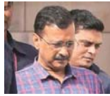
Arvind Kejriwal was arrested on March 21.

The Enforcement Directorate (ED) had on Thursday alleged that the CM, presently lodged in Tihar