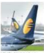
NCLAT told Jet's lenders to transfer the company to the successful bidder, JAC.

The NCLAT decision in March had brought a glimmer of hope for the bankruptcy airline, laying down prospects for revival. However, the lenders' plea in the Supreme Court is expected to bring it once again into uncertainty over the airline's future. In its order, the appellate tribunal instructed the consortium to make an operator's certificate a part of the bankruptcy process. It also directed Jet's lenders to establish security on three Delhi-based immovable properties offered by JAC within 30 days.