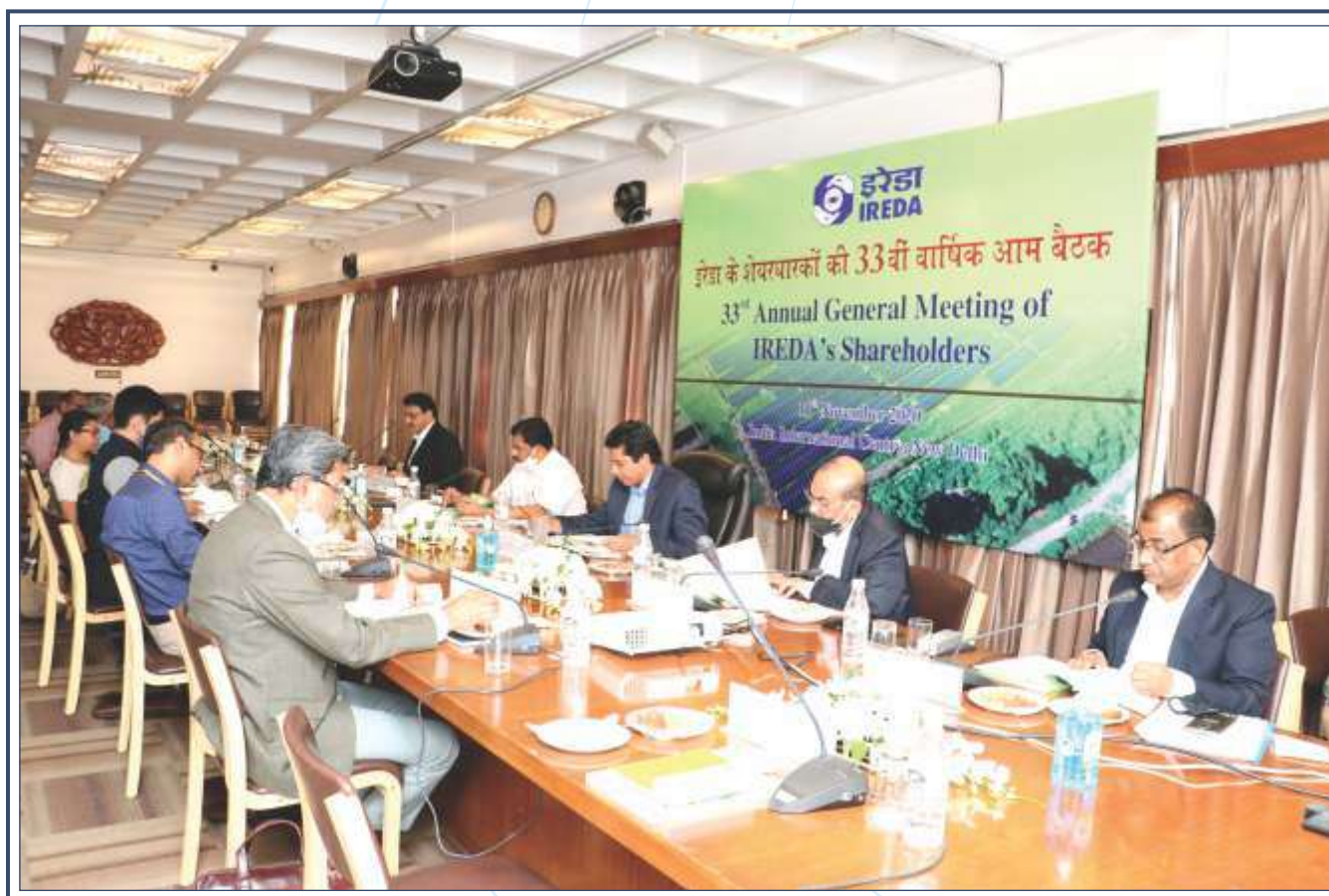
33 rd Annual General Meeting of IREDA held on November 11, 2020 in New Delhi